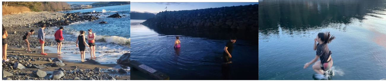
Polar Dip, cultural activity, is a known favorite recreation activity