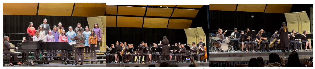
50 Braves traveled to Music Fest in Juneau by ferry, received accolades, standing ovations, and high praise from observers