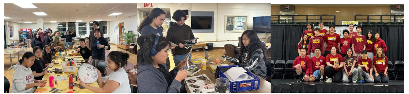
Art activities in the Main Dorm Lounge for Recreation is a hit