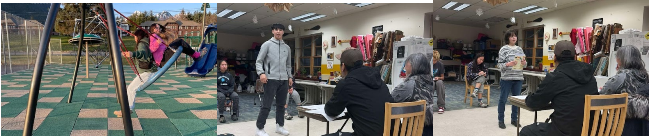
Playground fun - recreation activity